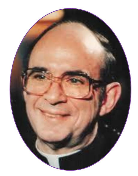
Joseph Cardinal Bernardin Celebrating the Ministry of Healing

"... although the Catholic tradition forcefully rejects euthanasia, it also would argue that no obligation exists, in regard to care for the terminally ill, to initiate or continue extraordinary medical treatments that would be ineffective in prolonging life or that would, despite their effectiveness, impose excessive burdens on the patient."